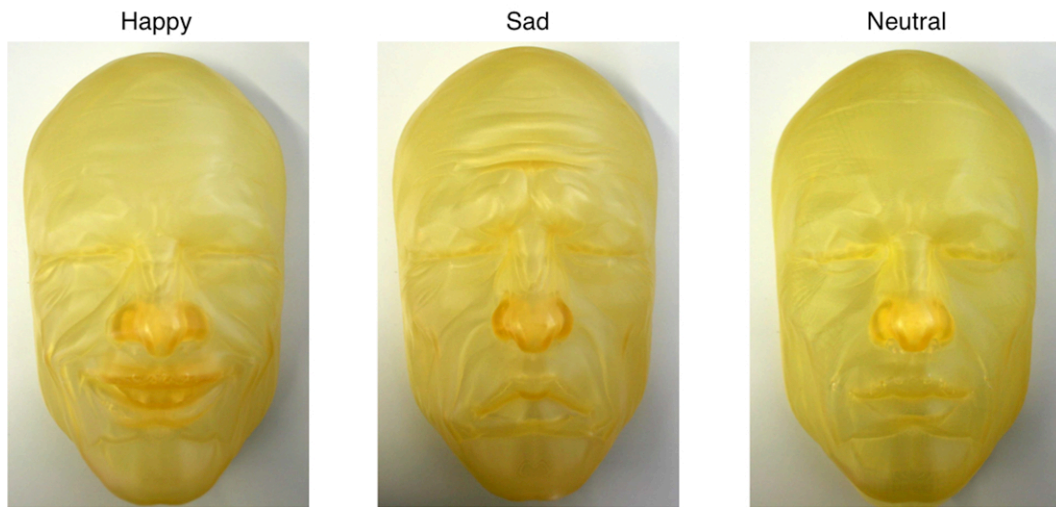
Figure 1. Facemasks depicting happy, sad, and neutral faces, respectively.

without adaptation. The test facemask was randomly chosen from three facemasks (happy, sad, and neutral). Each participant explored each test facemask once with a 1 min break between trials. The percentage of sad responses from participants was calculated for each test facemask. In the adaptation experiment, an adaptation facemask was positioned on the left side of a table in front of the participant, and a test facemask was placed on the right. During adaptation, participants haptically explored the adaptation facemask with their eyes closed for 20 s, after which they haptically explored the test facemask for 5 s. Participants were then requested to classify the test facemask as either happy or sad. The adaptation experiment was performed under two adaptation conditions: (1) with adaptation to a happy facemask and (2) with adaptation to a sad facemask. In both cases, the expression of the test facemask was neutral. Each participant explored the test facemask once for each adaptation condition with a 1-min break between tests. The percentage of sad responses from participants was calculated for each adaptation condition.